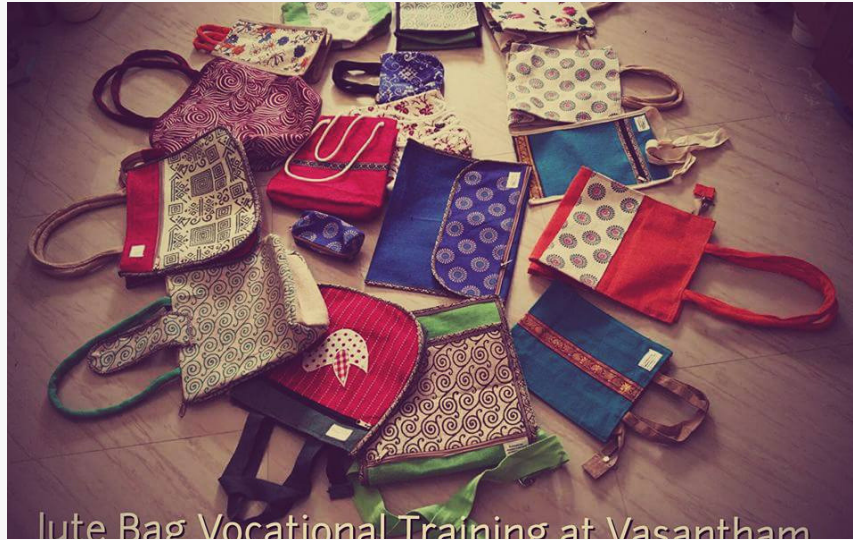
Jute Bag Vocational Training at Vasantham

Jute bags from the Vocational Training unit at Vasantham Tons of thanks to Zen Runners, Patterns SDI, and United Way of Chennai. Your constant support and motivation is a great source of encouragement to us :)